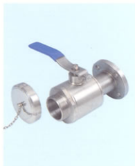
■ Ball valve.