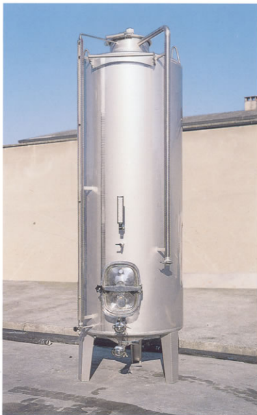
2500 litre storage minitank with accessories.