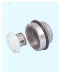
■ Safety valve.