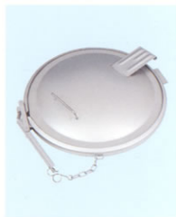
■ Upper manhole.