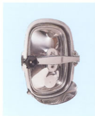
■ Lower manhole.