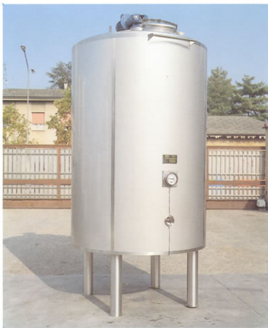
■ Thermo conditioned tank.