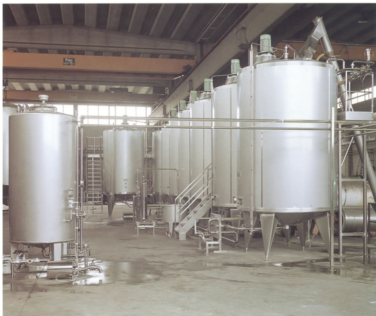
■ Soft drinks manufacturing plant.