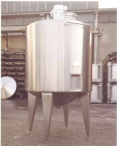
■ Thermo-conditioned mixer.