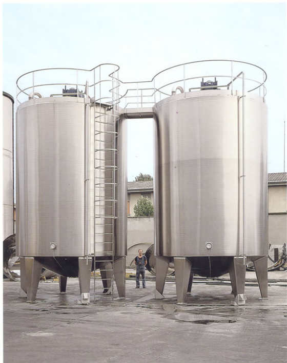
■ Chocolate mixers.