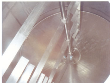
■ Mixer for chocolate.